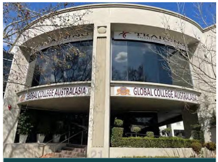
Moore Street Campus