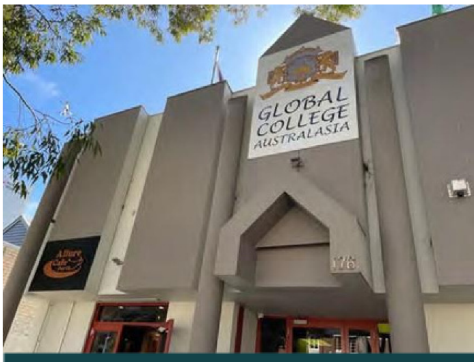
Wellington Street Campus

Global College Australasia is a modern and dynamic educational Institution providing high quality programmes in a congenial environment that promotes learning and motivates students to achieve excellence in their studies through practical Implementation.